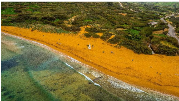
Ramla bay Gozo