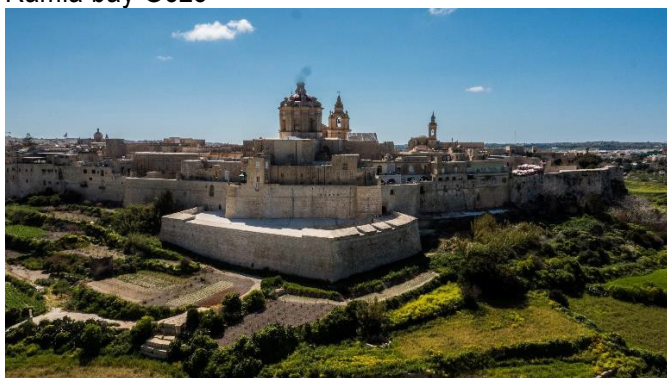
Silent City of Mdina