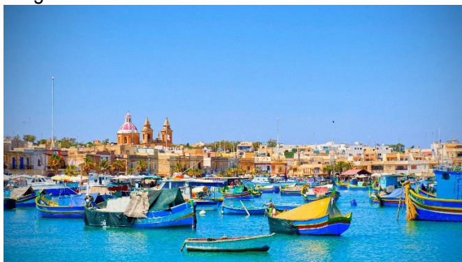
Marsaxlokk Fishing Village