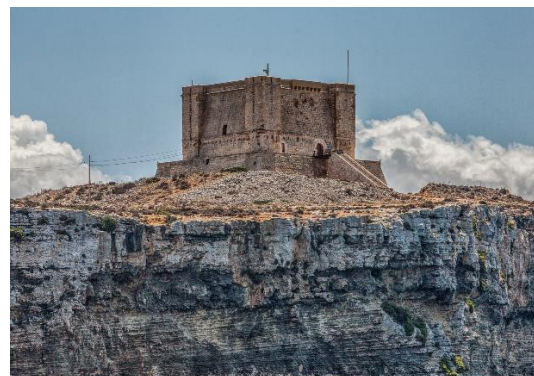
St Mary's Tower Comino