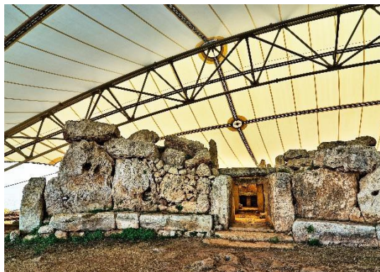
Hagar Qim Temples